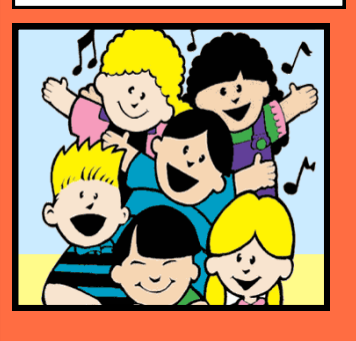
St. Augustine's Church Limerick Child Safeguarding Representatives.

Monday -Friday 7.30am, 8.30am, 10.15am, & 4pm SATURDAY 8.30am, 10.15am SUNDAY 9.00am, 11.15am & 7.30pm CONFESSIONS MONDAY & FRIDAY 10.45am-12 Noon 3.00pm-4.00pm SATURDAY 10.45am-12noon 2.30pm-4pm Location Adoration Chapel