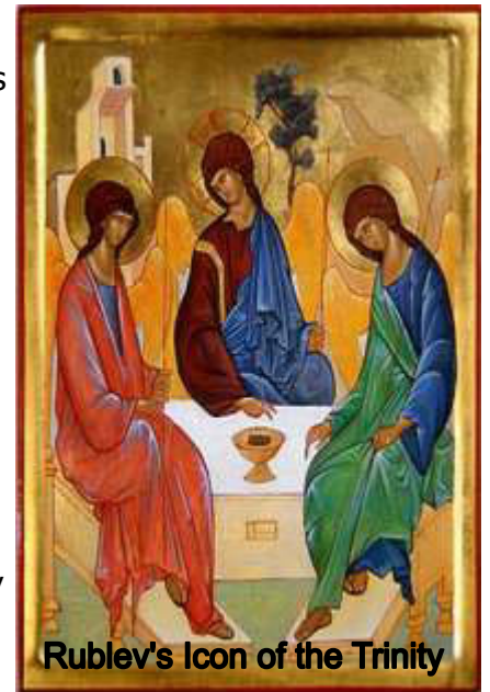
Rublev's Icon of the Trinity

God is love. There are Three Persons in the Holy Trinity whom we name as Father Son and Holy Spirit. Their mutual interactions represent the fullness of love. The Father loves the Son, the Son loves the Father; and we may picture the Holy Spirit as the outpouring of their love. In our innermost selves, we are made in the image of this triune God, of God the Father, who created us, of the Son who saved us, and of the Holy Spirit who continues to guide us. Something in our lives should reflect the Trinity, in whom we live and move and have our being. At our God-driven best, we are creative like the Father, compassionate like his Son, and dispose our talents in the service of others like the Holy Spirit.