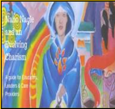
Nano Nagle and an Evolving Charism

Corpus Christi Procession Sunday 18th June 6pm Redemptorist Church Novena followed at 6.40pm by Procession to St. Joseph's Church.