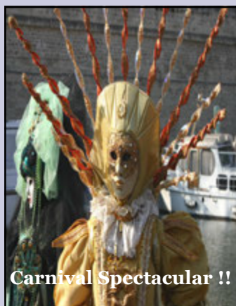
Carnival Spectacular !!