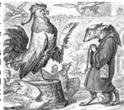
Prey Judging Predator

But family can be something else too. The so-called black sheep takes on a different hue when it's our own black sheep. "No matter whose ox is gored" may be a noble banner for truth and impartial justice but it doesn't seem so incontrovertible when the ox in danger is my own. In this matter the association called the Mafia sets a strong headline. It's not for nothing that in one of its stronger manifestations it styled itself La Famiglia , the family. The paramount value there is mutual support and cohesion. As against La Famiglia outsiders have no rights and can expect no concessions. General or universal rules about rights and justice make no impression when the welfare of the Family, even in small matters, is at stake. No outside claimant can expect any help from a family member when another family member is the respondent. Omerta is a law, not of God, King or Parliament but, in a certain milieu, maybe of life and death. And indeed news media headlines and court reports in our own country suggest that family ties play no small part in that flourishing branch of our economy called organised crime.